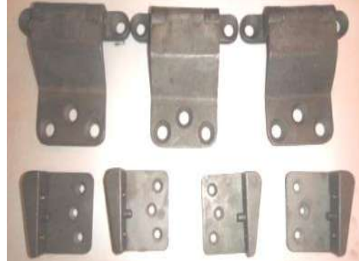
Hinges (ARAI Approved)