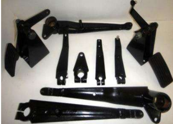
Clutch and Accelerator Levers