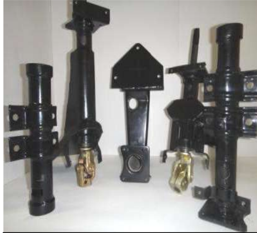
Steering Columns & their Assemblies