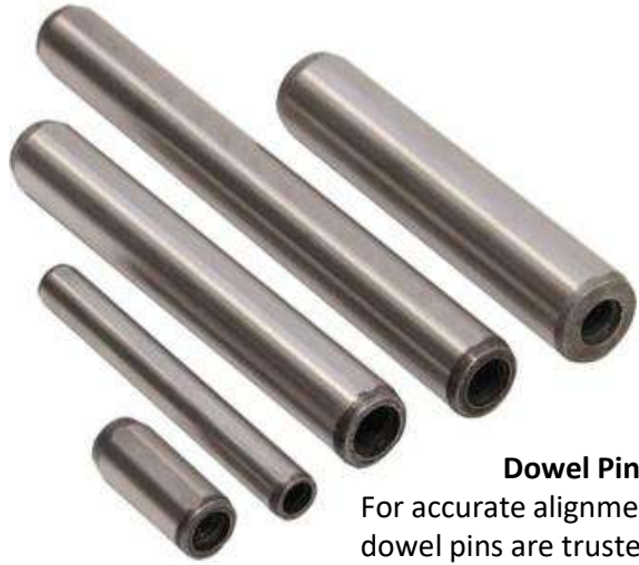
Dowel Pins For accurate alignments our dowel pins are trusted