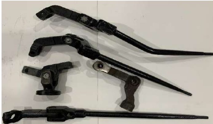
Gear Shifting Levers