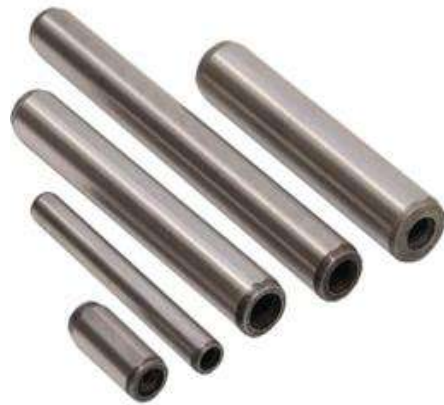
Turned Components & Assemblies