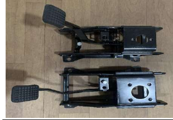
Clutch And Brake Pedal Assemblies