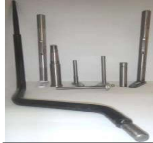
Gear Shifter Shafts and Levers