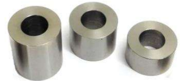
Spacers Our Spacers are well trusted to perform under extreme conditions