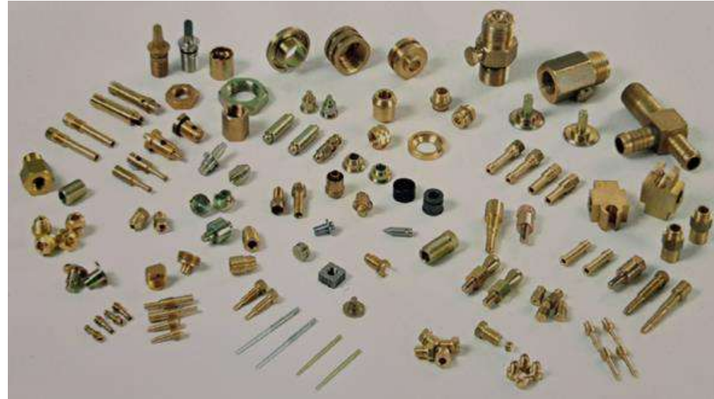
Precision Turned Components We make variety of turned components maintaining critical profiles as per customer specifications