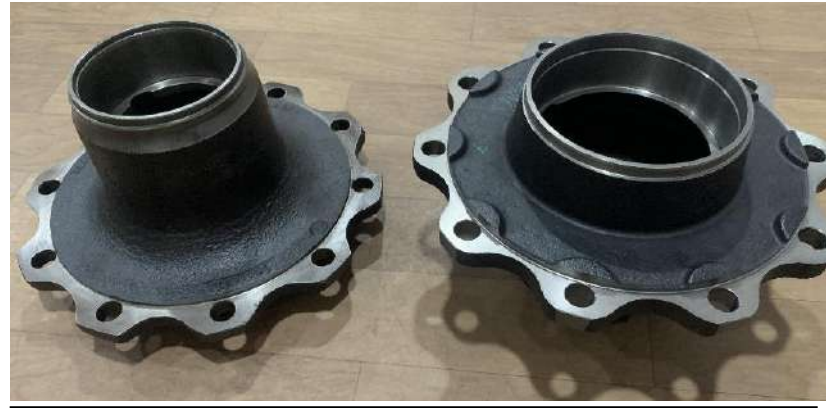
Front and Dummy Hubs