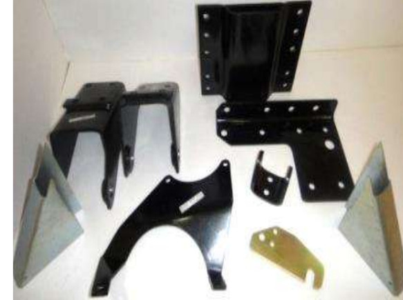
Fabricated and Sheet Metal Parts