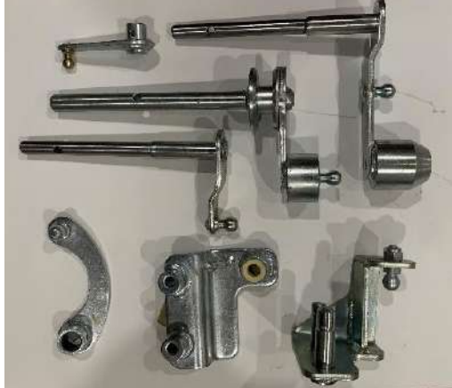
Gear Shifting Shaft & Bkts