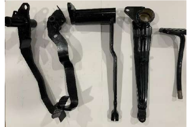
Clutch Pedals and Levers