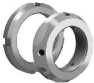
Retainer Nut These are used in extremely critical application areas of fastening