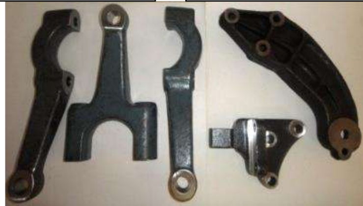
Engine Mounting Arms & Steering Arms