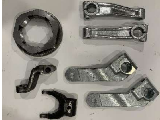
Gear Shifting Levers & Lock Nuts