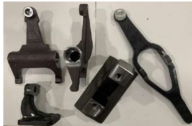
Clutch Yokes and Forks