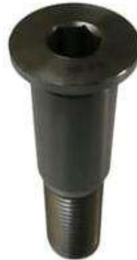
Cold Forged Parts