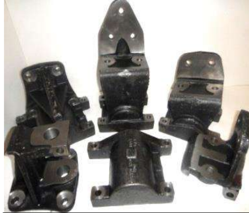
Spring Hanger Brackets