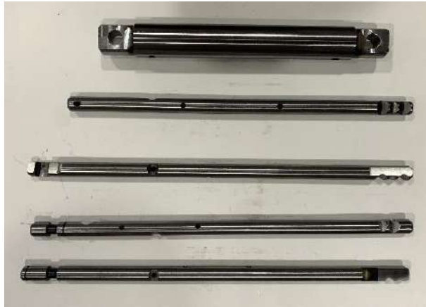
Shifter Shafts & Cross Shaft