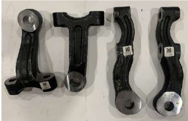
Steering and Tie Rod Arms